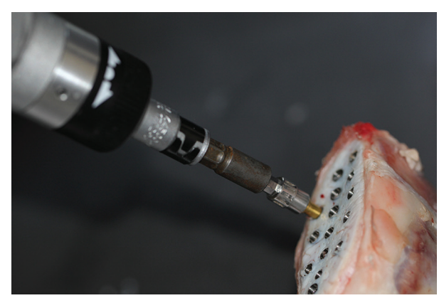
Fig. 3. Measurement of the implant stability by using RT method.

After completing the RFA and EPT measurements, implants were loosened using a pre-calibrated digital torque gauge (Cedar DID-04, Sugisaki Meter Co.,Ltd, Japan) and one reverse torque value (RTV) was recorded for each implant (Fig. 3).