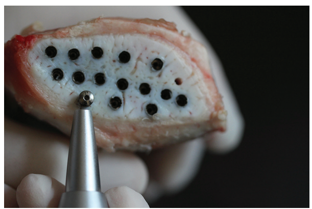
Fig. 1. Measurement of the implant stability by using RFA method.

dalen, Sweden). A magnetic peg pre-calibrated for Mode implants was inserted using a plastic screwdriver provided by the manufacturer (Smartpeg type 60, Integration Diagnostics, Savedalen, Sweden) and hand tightened. Osstell probe was held 1 mm away from the Smartpeg at a 90-degree angle both in the buccal and mesial directions for each implant (Fig. 1) and the RFA value was registered as implant stability quotient (ISQ) on the digital screen of the instrument. The mean of the buccal and mesial ISQs were calculated and recorded as one ISQ value for each implant.